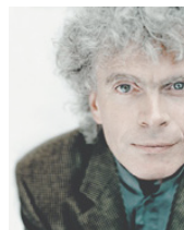
Sir Simon Rattle, CBE President of The Purcell School

The School is a vibrant place where creativity and discipline go hand in hand, providing specialist training for musicians of the future, alongside an excellent general education. It gives me great hope for the future of the music profession when I hear what these young people are capable of.'