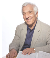
Vladimir Ashkenazy Patron of The Purcell School

The school's supportive family atmosphere allows pupils to immerse themselves in their musical studies alongside other talented young musicians, and to get closer to the heart of their music. I am very pleased to be able to support the school, and to help as many talented young musicians as possible to enjoy the opportunities available.'