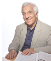
Vladimir Ashkenazy Patron of The Purcell School

The school's supportive family atmosphere allows pupils to immerse themselves in their musical studies alongside other talented young musicians, and to get closer to the heart of their music. I am very pleased to be able to support the school, and to help as many talented young musicians as possible to enjoy the opportunities available."