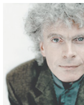
Sir Simon Rattle, CBE President of The Purcell School

The School is a vibrant place where creativity and discipline go hand in hand, providing specialist training for musicians of the future, alongside an excellent general education. It gives me great hope for the future of the music profession when I hear what these young people are capable of."